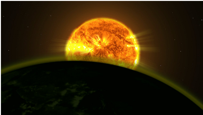
This illustration shows a star's light illuminating the atmosphere of a planet.

New NASA research is helping to refine our understanding of candidate planets beyond our solar system that might support life.