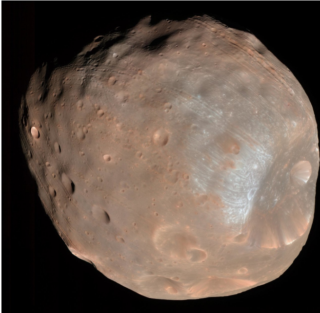
Phobos, the larger of Mars' two moons.

Powerful solar eruptions could electrically charge areas of the Martian moon Phobos to hundreds of volts, presenting a complex electrical environment that could possibly affect sensitive electronics carried by future robotic explorers, according to a new NASA study. The study also considered electrical charges that could develop as astronauts transit the surface on potential human missions to Phobos.