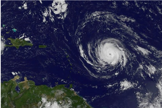
This image obtained from NASA's GOES Project shows Hurricane Irma churning near Caribbean islands