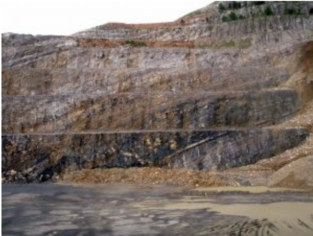
The Italcementi section located in the Lombardy Basin of northern Italy. Black layers of limestone mark the transition from the Upper Triassic to the Lower Triassic.

Extremely low oxygen levels in Earth's oceans could be responsible for extending the effects of a mass extinction that wiped out millions of species on Earth around 200 million years ago, according to a new study.