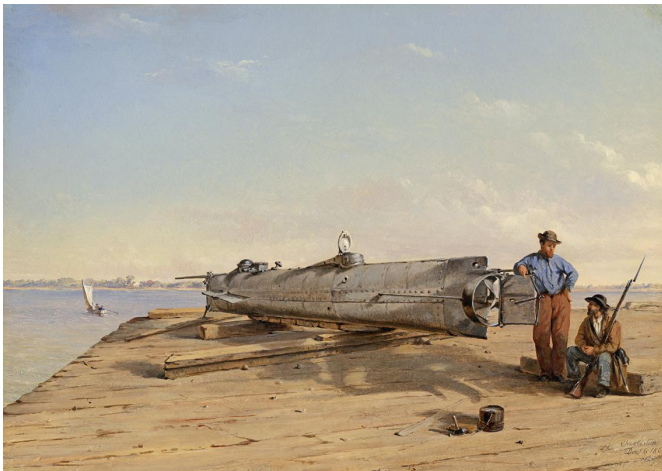
An oil painting by Conrad Wise Chapman, "Submarine Torpedo Boat H.L. Hunley, Dec. 6, 1863." Credit: Conrad Wise Chapman

Blast-lung is a phenomenon of something Lance calls "the hot chocolate effect." The shockwave of the blast would travel about 1500 meters per second in water, and 340 m/sec in air. "When you mix these speeds together in a frothy combination like the human lungs, or hot chocolate, it combines and it ends up making the energy go slower than it would in either one," thus amplifying the tissue damage. Lance said that when it crossed the lungs of the crewmen, the shockwave was slowed to about 30 m/s.