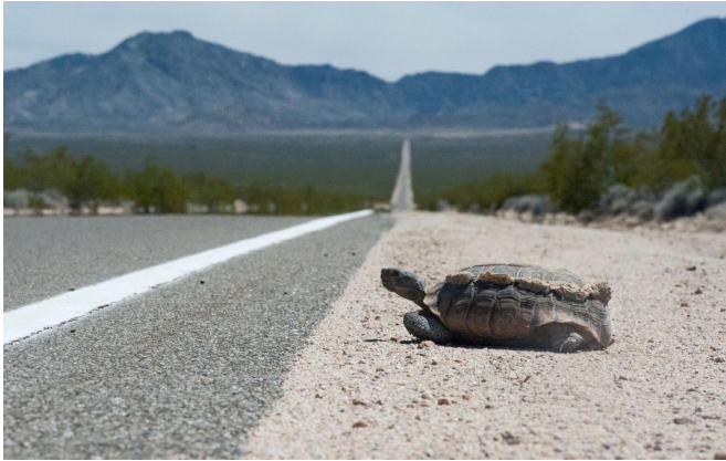
A desert tortoise tries to cross a road in southern California.

Desert tortoises pace back and forth and can overheat by roadside fencing meant to help them, according to a study published in the journal Biological Conservation by the University of California, Davis, and the University of Georgia.