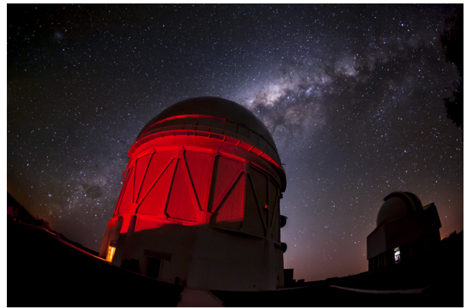
Blanco Telescope dome and Milky Way.

DES has now succeeded in carrying out such a precision test. The scientists used the fact that images of faraway galaxies get slightly distorted by the gravity of galaxies in the foreground - an effect known as weak gravitational lensing. This analysis