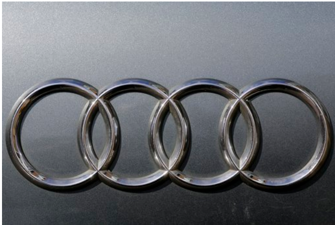
The brand logo of German car maker Audi is photographed on a car in Berlin, Tuesday, Aug. 1, 2017. German Transport Minister Alexander Dobrindt and Environment Minister Barbara Hendricks call the heads of German car makers for a meeting named National Diesel Forum to Berlin on Wednesday, Aug. 3, 2017.

photographed on a car in Berlin, Tuesday, Aug. 1, 2017. German Transport Minister Alexander Dobrindt and Environment Minister Barbara Hendricks call the heads of German car makers for a meeting named National Diesel Forum to Berlin on Wednesday, Aug. 3, 2017.