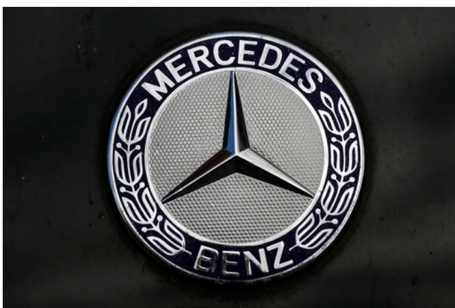
The brand logo of German car maker Mercedes Benz is photographed on a car in Berlin, Tuesday, Aug. 1, 2017. German Transport Minister Alexander Dobrindt and Environment Minister Barbara Hendricks call the heads

© 2017 The Associated Press. All rights reserved.