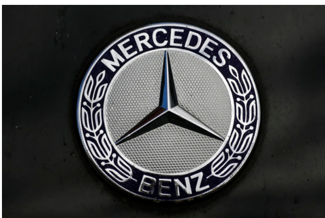
The brand logo of German car maker Mercedes Benz is photographed on a car in Berlin, Tuesday, Aug. 1, 2017. German Transport Minister Alexander Dobrindt and Environment Minister Barbara Hendricks call the heads