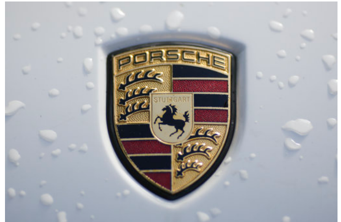
The brand logo of German car maker Porsche is photographed on a car in Berlin, Tuesday, Aug. 1, 2017. German Transport Minister Alexander Dobrindt and Environment Minister Barbara Hendricks call the heads of German car makers for a meeting named National Diesel Forum to Berlin on Wednesday, Aug. 3, 2017. (AP Photo/Markus Schreiber)

of German car makers for a meeting named National Diesel Forum to Berlin on Wednesday, Aug. 3, 2017. (AP Photo/Markus Schreiber)