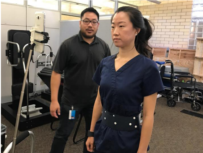
Smarter Balance System.

University of Houston researchers in the Department of Health and Human Performance are helping patients with Parkinson's disease regain stable balance and confidence in performing daily activities in their own homes. A research team is developing the Smarter Balance System (SBS), a smartphone-based biofeedback rehabilitation system that guides patients through a series of balance exercises using wearable technology.