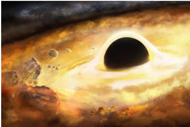
Artistic rendering of a black hole accumulating matter at the center of a galaxy.

Astronomers from Swinburne University of Technology, Australia, and the University of Minnesota Duluth, USA, have provided a way for armchair astronomers, and even primary school children, to merely look at a spiral galaxy and estimate the mass of its hidden, central black hole. The research was supported by the Australian Research Council and has been published in the journal Monthly Notices of the Royal Astronomical Society .