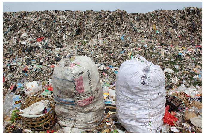
Plastic picked from the landfill for recycling.

Led by a team of scientists from the University of Georgia, the University of California, Santa Barbara and Sea Education Association, the study is the first global analysis of the production, use