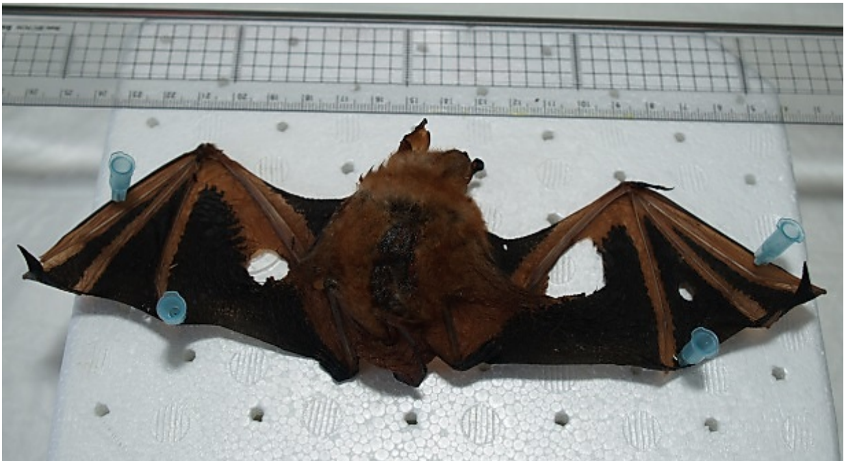
M. rufoniger carcass, found in Gosudonggul cave, Danyang, in South Korea.

A recent study, affiliated with the Korean Genomics Industrialization and Commercialization Center (KOGIC) at South Korea's Ulsan National Institute of Science and Technology (UNIST) has presented the first whole genome sequence and analyses of the Myotis rufoniger , one of the most well-known and iconic protected wild animals in South