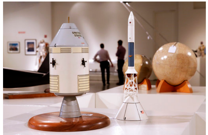
A Custom Command/Service Module, and Planetary Globe, right, to be offered at auction at Sotheby's, are displayed in New York, Thursday, July 13, 2017. The Custom Command/Service Module is estimated at $5,000 to $7,000.