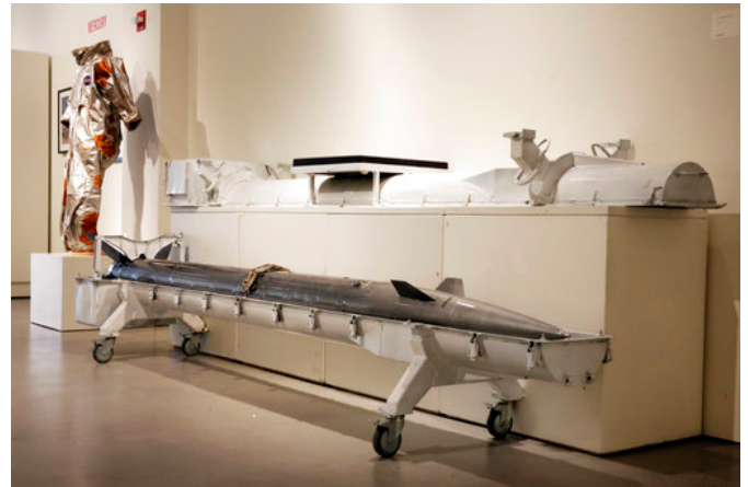
A Gemini G1C Spacesuit Thermal Coverlayer, left, and a Wind Tunnel Test Model, to be offered at auction at Sotheby's, are shown in New York, Thursday, July 13, 2017. The spacesuit is estimated at $40,000 to $60,000 while the test module is estimated at $8,000 to $12,000.

Calling it "a magnificent picture," he wrote: "The Earth had a very distinct and pretty blue halo. This halo could be clearly seen when looking at the horizon. It had a smooth transition from pale blue to blue, dark blue, violet and absolutely black."