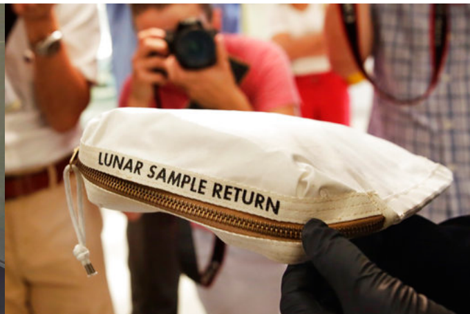
The Apollo 11 Contingency Lunar Sample Return Bag used by astronaut Neil Armstrong, to be offered at auction, is displayed at Sotheby's, in New York, Thursday, July 13, 2017. The lunar dust plus some tiny rocks that Armstrong also collected are zipped up in a small bag and are worth an estimated $2 million to $4 million.