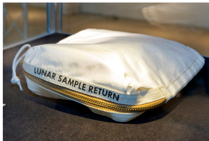
The Apollo 11 Contingency Lunar Sample Return Bag used by astronaut Neil Armstrong, to be offered at auction, is displayed at Sotheby's, in New York, Thursday, July 13, 2017. The lunar dust plus some tiny rocks that Armstrong also collected are zipped up in a small bag and are worth an estimated $2 million to $4 million.