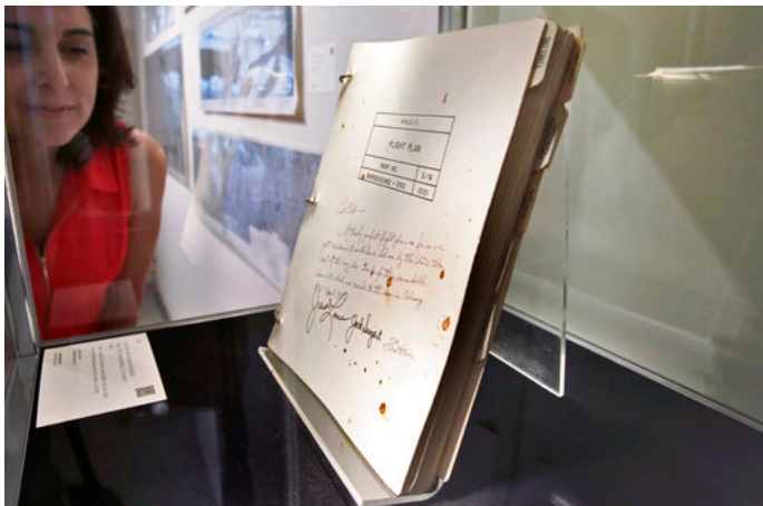
The Apollo 13 Flown Flight Plan, with extensive annotations by the crew, to be offered at auction at Sotheby's, is displayed in New York, Thursday, July 13, 2017. It is estimated at $30,000 to $40,000.