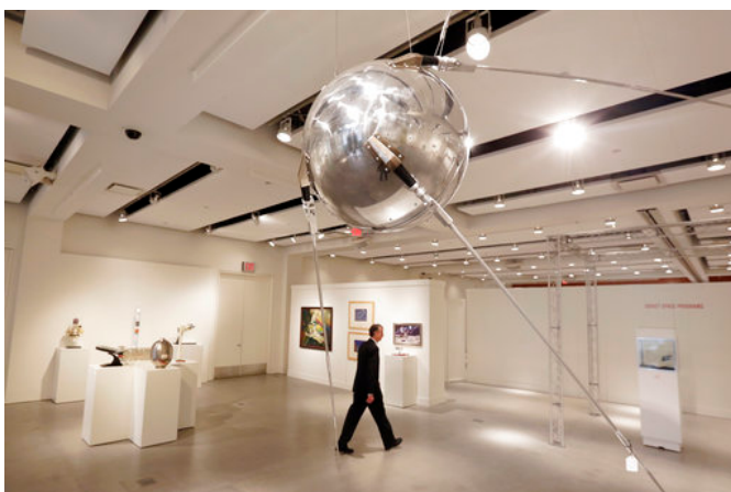
A full scale Custom Sputnik-1 model, above, to be offered at auction at Sotheby's, is displayed in New York, Thursday, July 13, 2017. It is estimated at $8,000 to $12,000.