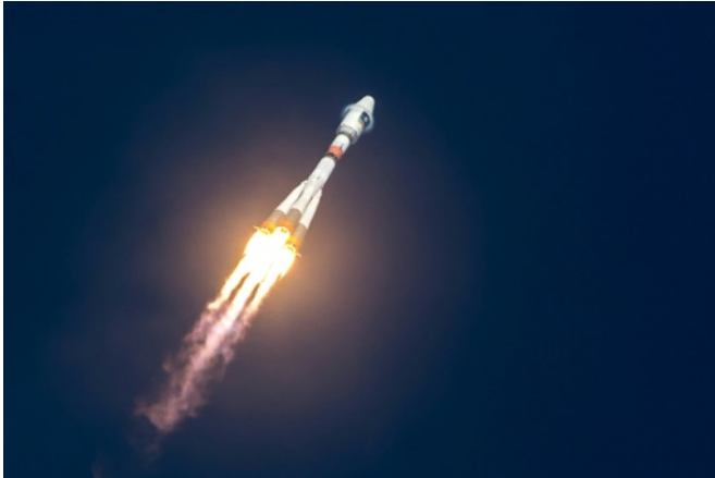
A Soyuz rocket blasting off from the European Space Center, pictured in December 2015, launching one of the four satellites of the Galileo satnav system

Investigators have uncovered the problems behind the failure of atomic clocks onboard satellites belonging to the beleaguered Galileo satnav system, the European Commission said Monday.