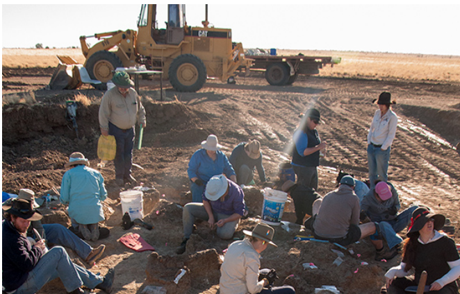
Uncovering the skeleton at the dig site in Queensland.