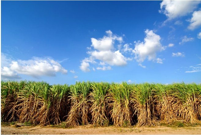
Sugarcane planted in with traditional spacing (pictured here) is better for yields but may be worse for plants and soil quality.

As farmers survey their fields this summer, several questions come to mind: How many plants germinated per acre? How does altering row spacing affect my yields? Does it make a difference if I plant my rows north to south or east to west? Now a computer model can answer these questions by comparing billions of virtual fields with different planting densities, row spacings, and orientations.