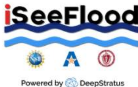
The iSeeFlood app.

"We are hopeful that the collaboration with DeepStratus will help UTA take this cell phone application worldwide," Seo said. "This crowdsourcing tool can not only inform the citizens for real-time decision making but also help build the data we need to understand and cope with flash flooding worldwide in a more intelligent and data-driven way."