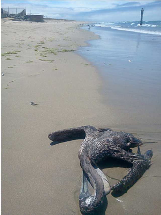
This dead pelican washed up on a beach in Monterey bay during the toxic algal bloom in May 2015. Researchers do not know exactly why the pelican died, but its stomach contained extremely high concentrations of domoic acid.

Ryan first considered the possibility that unusually warm ocean waters might have played a role in the bloom. From 2014 to 2016 the surface water in the Northeastern Pacific was much warmer than usual—a phenomenon nicknamed the "warm blob." But after comparing 2015 conditions with historical data, Ryan found that the waters in Monterey Bay were not unusually warm during the bloom. Warm water did affect the bay before and after the bloom, but during the spring of 2015 the waters were cooled by local upwelling.