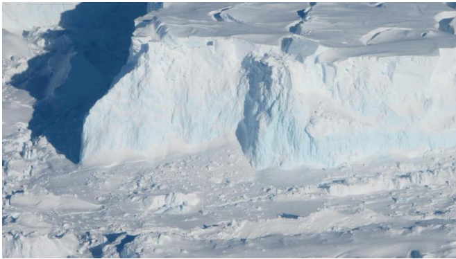
Thwaites Glacier.

The melt rate of West Antarctica's Thwaites Glacier is an important concern, because this glacier alone is currently responsible for about 1 percent of global sea level rise. A new NASA study finds that Thwaites' ice loss will continue, but not quite as rapidly as previous studies have estimated.