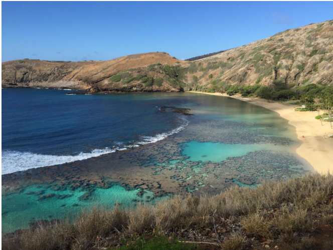
Hanauma Bay Nature Preserve on a Tuesday: the one day each week without visitors.

These water flow patterns were a major focus of the study as the researchers wanted to determine why bleaching occurred more severely in certain areas of the preserve. They found the highest amount of bleaching and mortality in areas where water tends to warm up and pool for extended periods of time. Other areas benefit from a circulation pattern that flushes cool water in and warm water out more quickly.