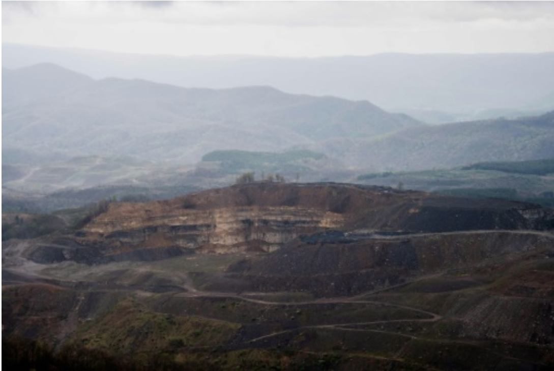
View of an unused coal mine at Black Mountain, Virginia, on April 18, 2017

That rebirth involves deploying high-speed internet—scarce in the remote state—turning blighted industrial areas into a new research and development park, and retraining dislocated workers in highly-skilled fields from solar and craft furniture, to organic farming on former strip mine sites.