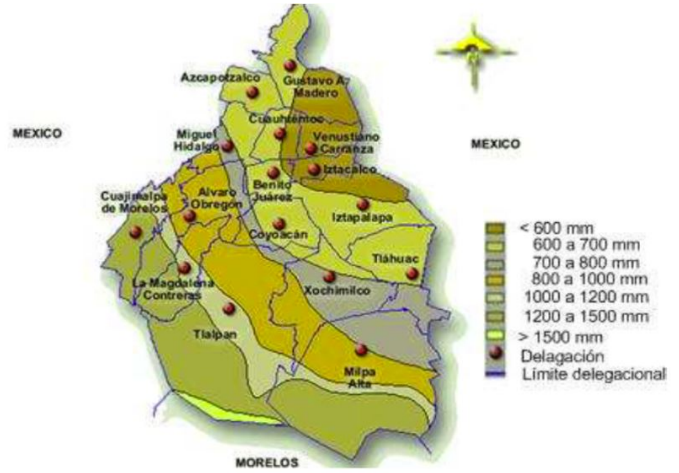
Annual mean precipitation in Mexico City (CONAGUA, 2009)