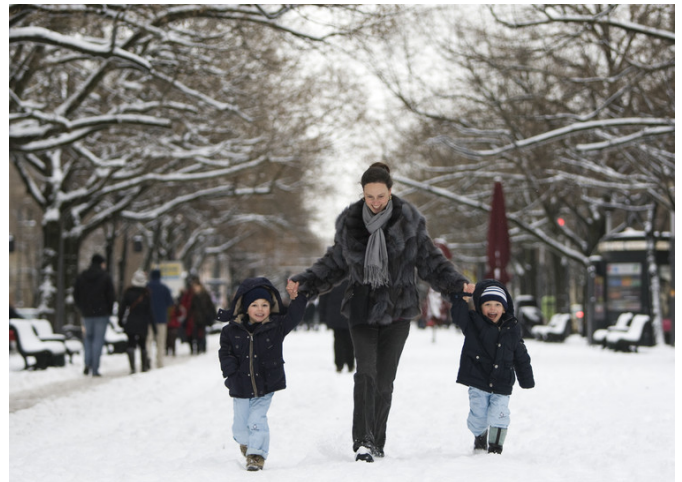
Germany lacks structures to help mothers with childcare.

Our research examined the wealth consequences of parenthood in Germany, where women have achieved equal status compared to men in many respects. Nonetheless, a traditional division of labour , where men are the main breadwinners, still dominates here.