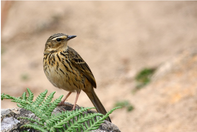
A Nilgiri pipit ( Anthus nilghiriensis ) in the western Ghats, a mountainous biodiversity hotspot in southern India.

A new study indicates that the number of plant and animal species at risk of extinction may be considerably higher than previously thought. A team of researchers, however, believe they've come up with a formula that will help paint a more accurate picture.