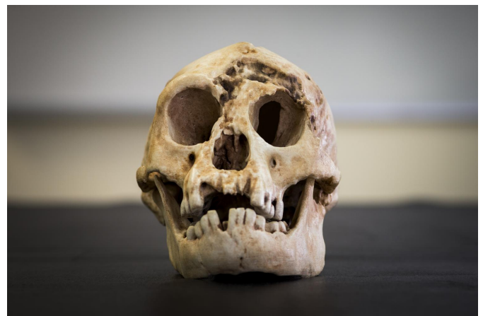
A reconstructed skull of Homo floresiensis .

"It's possible that Homo floresiensis evolved in Africa and migrated, or the common ancestor moved from Africa then evolved into Homo floresiensis somewhere."