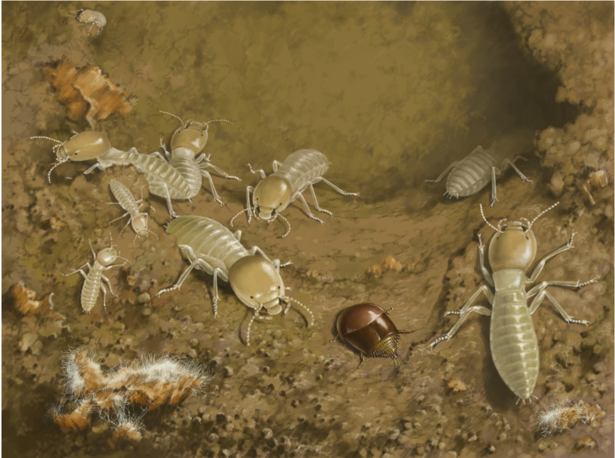
Ecological reconstruction of the mid-Cretaceous termitophille. Credit: Cai et al., 2017

The peculiar fossil rove beetles, named as Cretotrichopsenius burmiticus Cai et al., 2017, exhibits the characteristic features of the modern aleocharine tribe Trichopseniini, including the articulation of the hind leg whereby the coxae are fully fused and incorporated into the metaventrite.