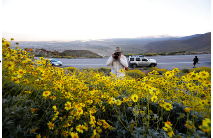
In this March 27, 2017, photo, retired California state park ranger Jim Long, of San Clemente, Calif., takes pictures among blooming desert shrubs in Borrego Springs, Calif. Rain-fed wildflowers have been sprouting from California's desert sands after lying dormant for years - producing a spectacular display that has been drawing record crowds and traffic jams in area desert towns.

"It is absolutely phenomenal to see this many blooming desert plants all at the same time," she said. "I think it's probably a once-in-a-lifetime thing."