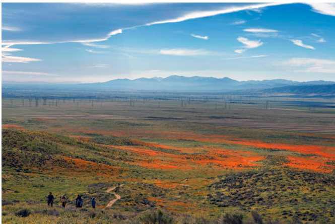
In this March 19, 2017, photo, visitors walk among the poppy bloom at Antelope Valley California Poppy Reserve in Lancaster, Calif. Rain-fed wildflowers have been sprouting from California's desert sands after lying dormant for years - producing a spectacular display that has been drawing record crowds and traffic jams to desert towns.