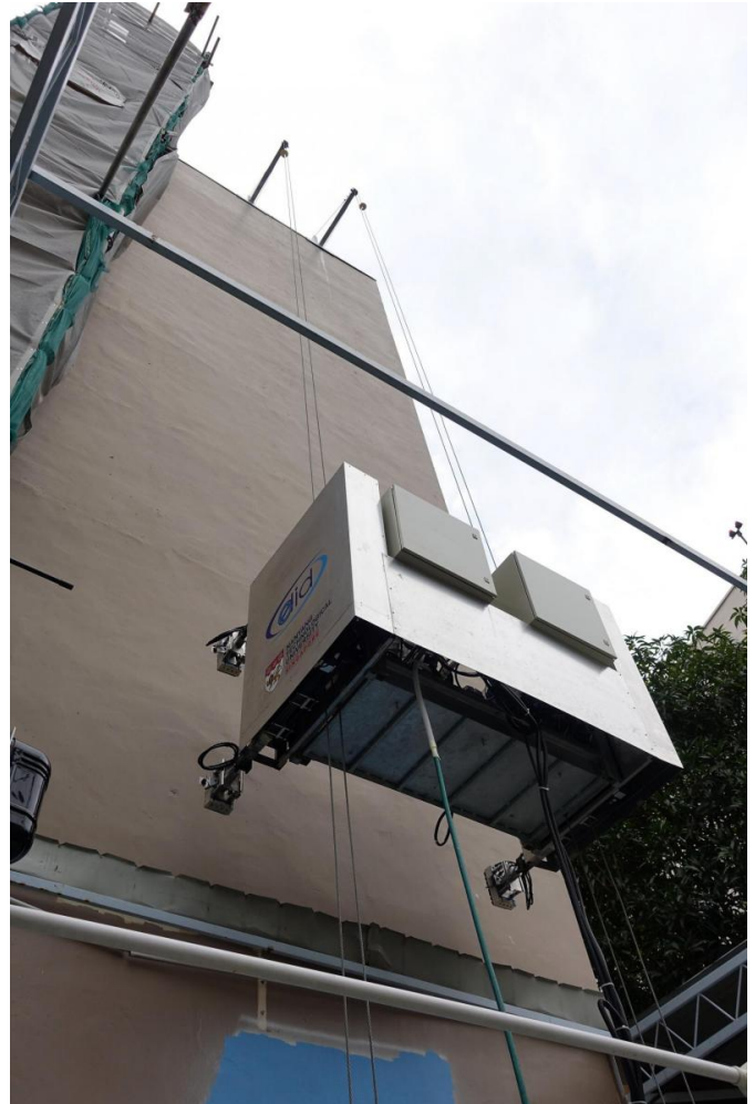
ELID-NTU robot can paint and wash, consisting of a customised automated gondola and a robotic arm.

To speed up the process at the same building, multiple systems can be deployed.