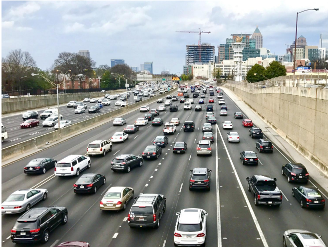
Rush hour traffic on the downtown connector in Atlanta.

Though tailpipe emissions could fall in the years ahead as more zero-emission vehicles hit the streets, one major source of highway air pollution shows no signs of abating: brake and tire dust.