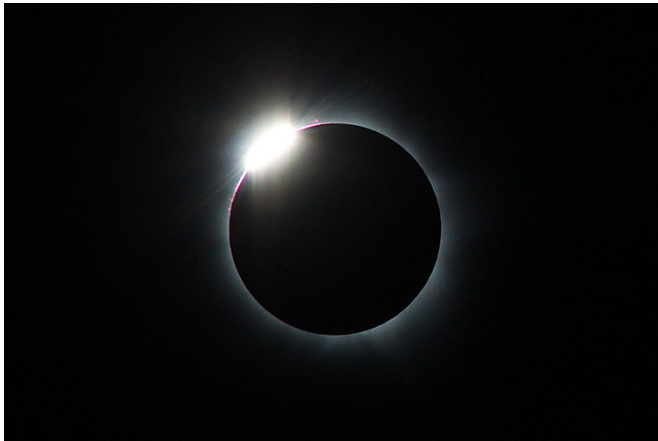
A classic 'diamond ring' effect seen just before the moon completely covers the face of the sun during a total solar eclipse like the one that will traverse the United States on Aug. 21.

With only six months to go before one of the most anticipated solar eclipses in a lifetime, the University of California, Berkeley, and Google are looking for citizen scientists to document and memorialize the event in a "megamovie," and help scientists learn about the sun in the process.