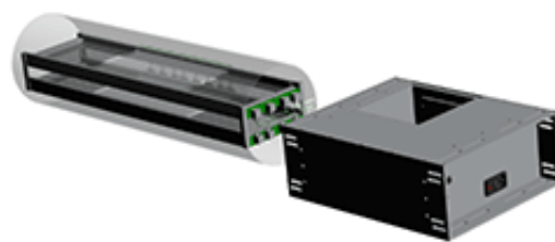
Prototype of the borehole-sized muon detector.

Researchers at PNNL and their partners have created a borehole-sized muon detector—just five inches in diameter and about two feet long—that can be inserted deep into the earth. This first-of-its-kind device—funded by the DOE Office of Fossil Energy(Offsite link) as part of the Subsurface Technology and Engineering Research (SubTER) Crosscut—is a groundbreaking advancement for underground density imaging.