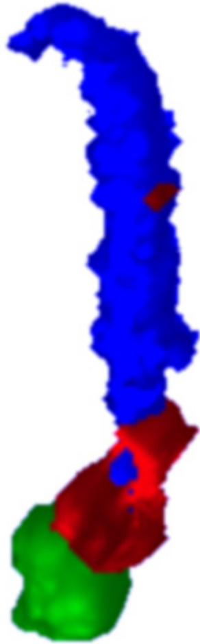
Image of a cilium from a mouse cell with the cilium stained in blue and Caveolin in red. The base of the cilium is shown in green.

Primary cilia are antenna-like structures present on the surface of most cells in the human body. The cilia are essential mediators of communication between cell types in the body. If the cilia are defective, this communication is disrupted, and the cells are unable to appropriately regulate important cellular processes, which ultimately can lead to severe diseases that may affect nearly every organ and tissue in developing embryos as well as adults.