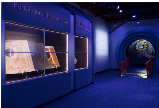
This Tuesday, Jan. 24, 2017 photo provided by NASA shows part of the Apollo 1 exhibit at the Kennedy Space Center in Titusville, Fla. On Jan. 27, 1967, a fire during a test on the launch pad killed three astronauts at the start of the Apollo moon program.