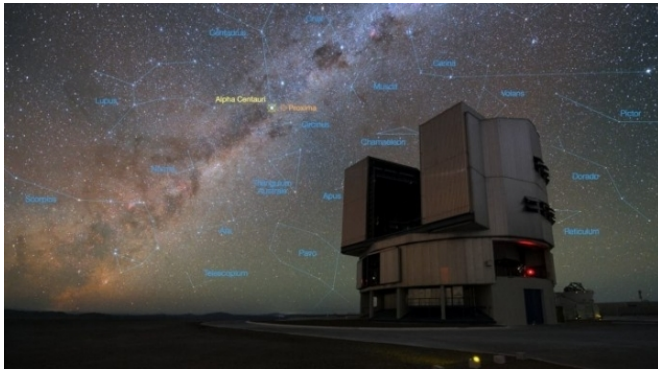
The VLT – Very Large Telescope – and the Alpha Centauri star system.

Researchers at Uppsala University plan to manufacture a new type of coronagraph for the VLT, the Very Large Telescope in Chile. The coronagraph is a key component of the telescope which will be used to search for planets in the neighbouring star system Alpha Centauri.