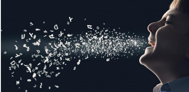
What is it that gives us a voice?

Macaques and baboons – two distantly related primates – are able to produce a similar range of voice-like sounds to humans.