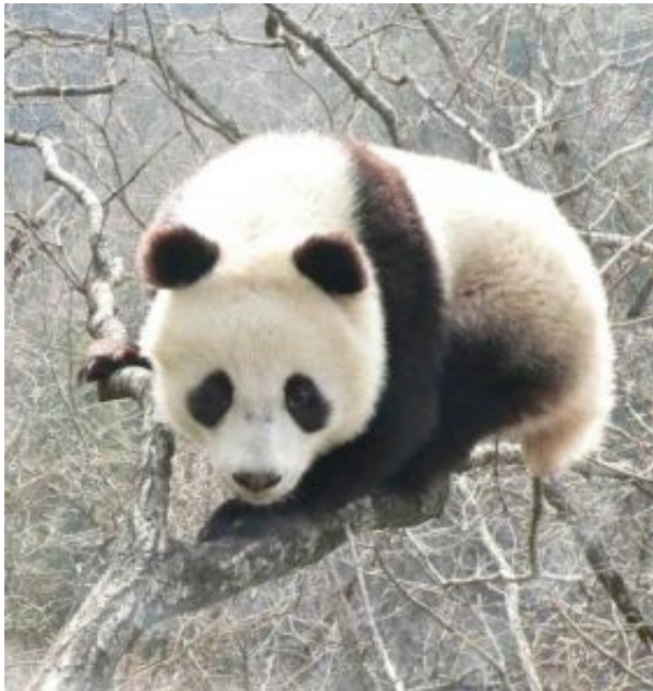
Giant panda.

(Phys.org)—A team of researchers at the Chinese Academy of Sciences has conducted a comparison of the genomes of giant and red pandas and has found differences due to adaptive convergence. In their paper published in Proceedings of the National Academy of Sciences , the team describes how they sequenced the genome of a wild red panda and the differences they found when comparing it with the giant panda genome.