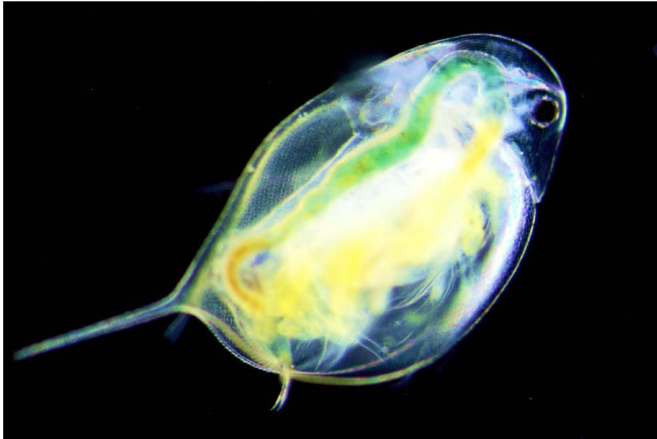
Zooplankton rapidly evolve tolerance to moderate levels of road salt.

A common species of zooplankton—the smallest animals in the freshwater food web—can evolve genetic tolerance to moderate levels of road salt in as little as two and a half months, according to new research published online today in the journal Environmental Pollution . The study is the first to demonstrate that the animals can rapidly evolve higher tolerance to road salt, and indicates that freshwater ecosystems may possess some resilience in the face of a 50-fold increase in road deicing salt applications since the 1940s.