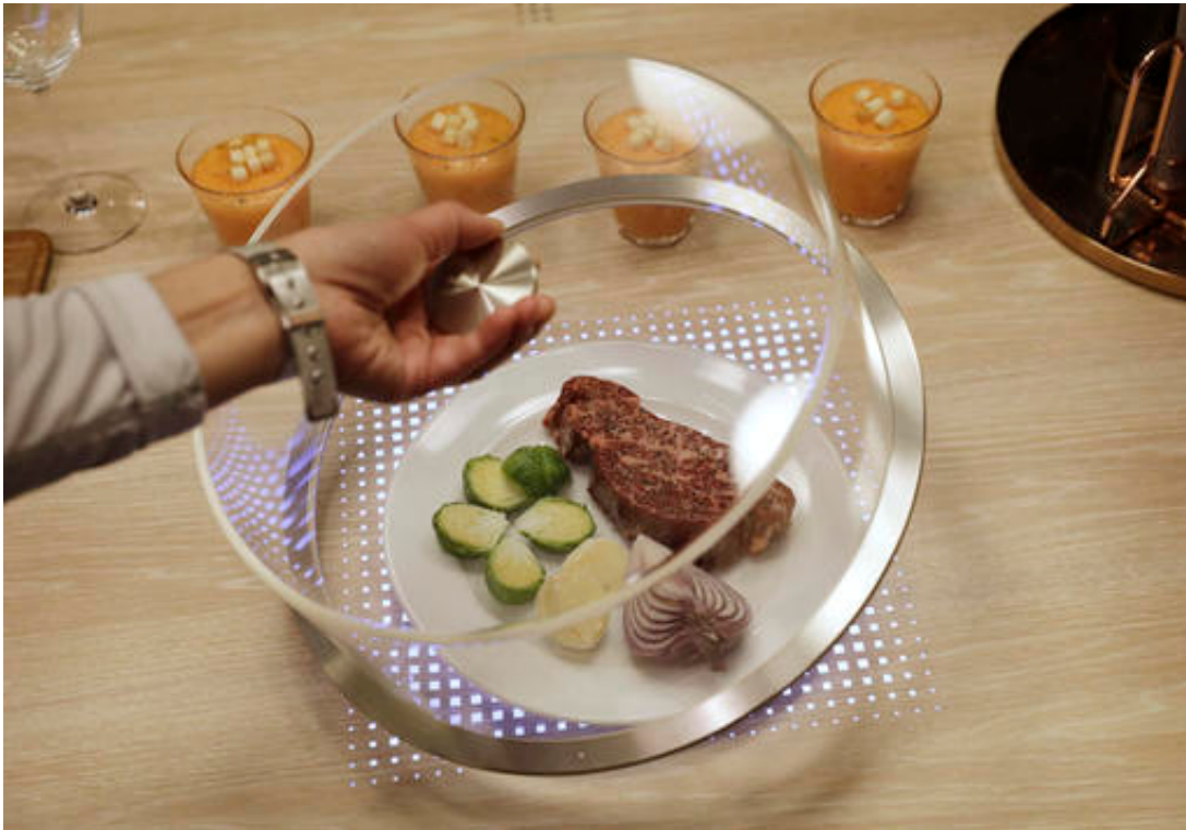
The Flat Top Cooker table is on display at the Panasonic booth during CES International, Thursday, Jan. 5, 2017, in Las Vegas. The prototype device is designed to cook your food when the cover is placed over it.