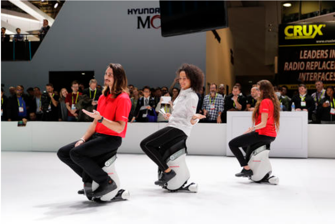
Models sit the Honda UNI-CUB electric scooters at CES International Thursday, Jan. 5, 2017, in Las Vegas.