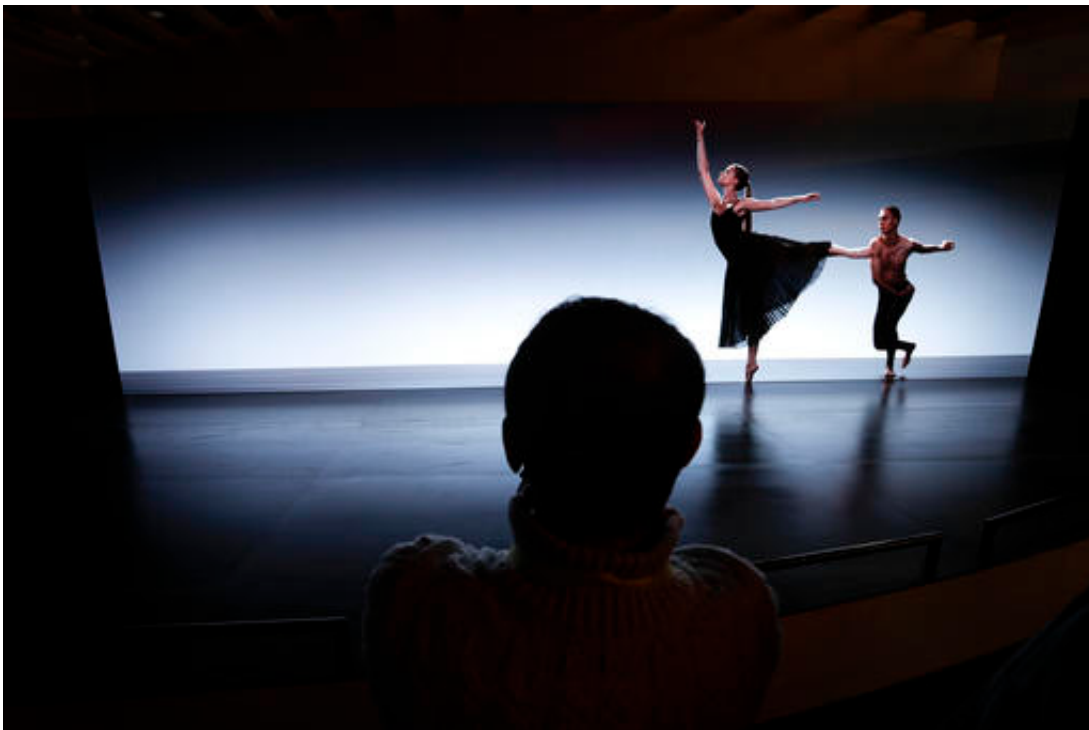
A show attendee stands in front of the Sony's CLEDIS display system during a news conference at CES International Wednesday, Jan. 4, 2017, in Las Vegas.

And T-Mobile's unlimited plan isn't exactly unlimited. If the network is busy, T-Mobile may slow speeds on customers that used more than 28 gigabytes.