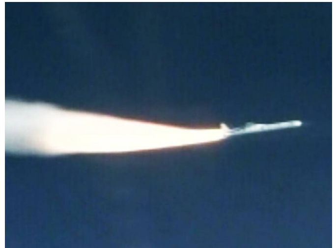
A Pegasus XL rocket carrying eight Cyclone Global Navigation Satellite System (CYGNSS) spacecraft fires its first-stage engine following release from the Orbital ATK L-1011 Stargazer aircraft over the Atlantic Ocean off Daytona Beach, Florida, on Dec. 15, 2016.

accurate measurements of ocean surface winds in and near a hurricane's inner core, including regions beneath the eyewall and intense inner rainbands that previously could not be measured from space. CYGNSS will do this by using both direct and reflected signals from existing GPS satellites to obtain estimates of surface wind speed over the ocean.