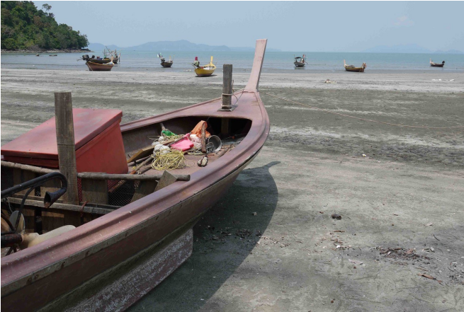
Fishing boats on the beach in front of a marine protected area in Thailand. Fishers have to travel further to fish.

People must be part of the equation in conservation projects. This will increase local support and the effectiveness of conservation.