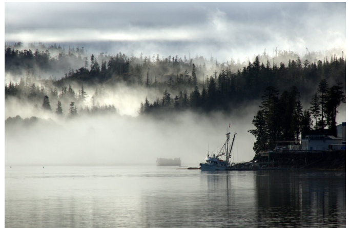
A fishing community in Port Hardy on the Pacific Coast of Canada. Stakeholders needs are taken into account in marine planning.

Increasingly, natural scientists and social scientists are partnering to try to consider both the needs of nature and of stakeholders. But for lack of good precedent, funding and will, often conservation organizations and activities don't fully consider the human dimensions of conservation, the authors found.