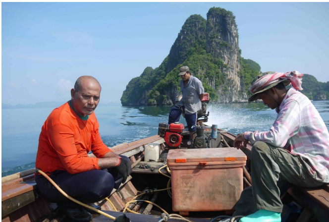
Some small-scale fishers on the Andaman coast of Thailand feel resentful about marine protected areas, as they were not consulted and their needs were not considered.