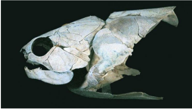
The armour of the 380 million year old placoderm fish Mcnamaraspis kaprios.