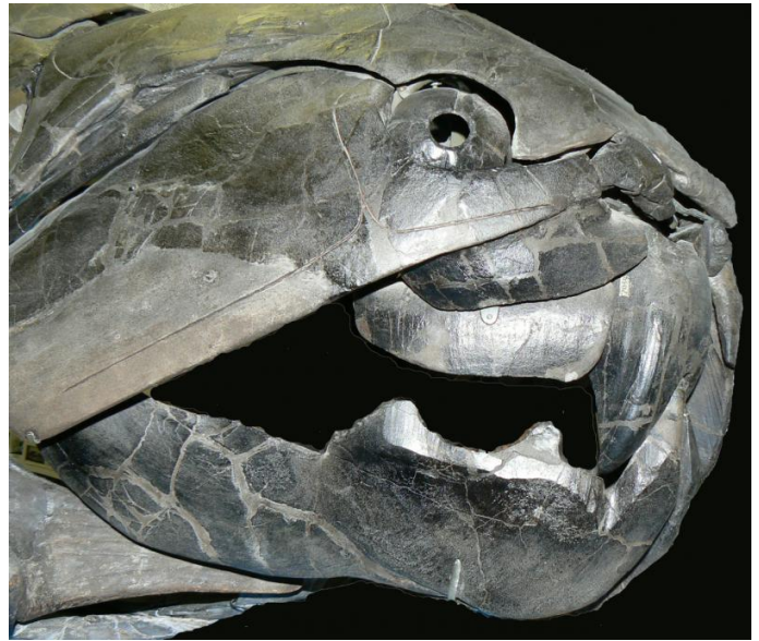
The iconic placoderm Dunkleosteus.

This is where our new methods come in. We used a sophisticated new model for producing genealogies that not only looks at anatomical features, but also considers other sources of information, such as the geological ages of the fossils and how much evolution they have undergone.