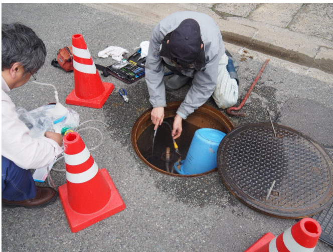
Scientists collect groundwater sample from a well in the Kumamoto earthquake region.

"More studies should be conducted to verify our correlation in other earthquake areas," says Sano. "It is important to make on-site observations in studying earthquakes and other natural phenomena, as this approach provided us with invaluable insight in investigating the Kumamoto earthquake," he adds.