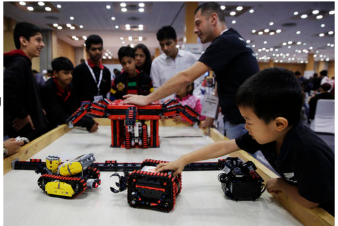
In this Sunday, Nov. 27, 2016, photo, a boy plays with a robot during the World Robot Olympiad in New Delhi, India. The weekend games brought more than 450 teams of students from 50 countries to the Indian capital.

"We start with the fundamentals. We believe that if kids can start from a very young age ... it teaches them how to build," she said. "Then it teaches them logical thinking. How to change something quickly."