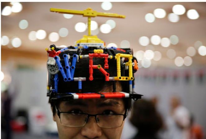
In this Sunday, Nov. 27, 2016 photo, a participant is seen at the World Robot Olympiad in New Delhi, India. The weekend games brought more than 450 teams of students from 50 countries to the Indian capital. The idea is to teach children computer programming at a young age.