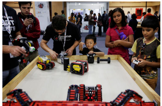
In this Sunday, Nov. 27, 2016, photo, participants and spectators watch robots displayed at the World Robot Olympiad in New Delhi, India. The weekend games brought more than 450 teams of students from 50 countries to the Indian capital.