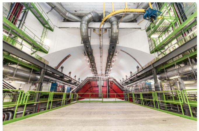
While all the experiments will take some data, the lower energy run is being conducted mostly for the scientists at CERN's ALICE experiment, who want to collect much more data, at higher precision than in 2013.

But one night in September 2012, LHC physicists chose to collide beams made of two different particles for the first time – heavy ions with the less-massive protons. Analysing the data, the researchers were surprised to see in a fraction of the collisions signs of a collective expansion of the system, a sort of mini-Big Bang. This is a characteristic hallmark of lead-lead collisions, and well known to be associated with the properties of quark-gluon plasma, but it had never been seen in lead-proton collisions before.