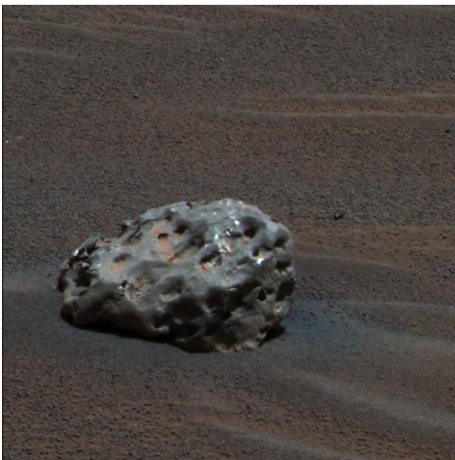
Image of the iron meteorite found on Mars by the Opportunity rover on the Sol 339 (Jan. 6th, 2005).