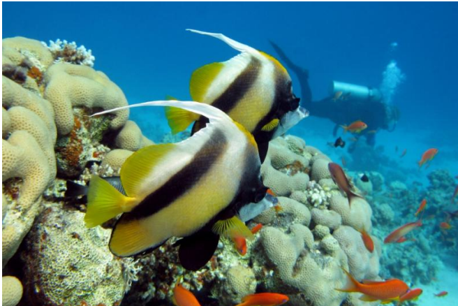
Moorish Idols swimming.

Every year the temperate waters off south eastern Australia receive an influx of tropical fish larvae from the Great Barrier Reef. Transported southward by the East Australian Current they are doomed never to reach adulthood. By July, as water temperatures drop, juvenile mortality reaches close to 100 per cent.