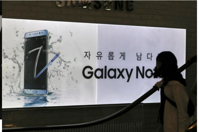
A visitor passes by an advertisement of the Samsung Electronics Galaxy Note 7 smartphone at its shop in Seoul, South Korea, Tuesday, Oct. 11, 2016. Samsung said Tuesday it is halting sales of the star-crossed Galaxy Note 7 smartphone after a spate of fires involving new devices that were supposed to be safe replacements for recalled models.