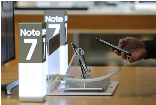
A visitor tries the Samsung Electronics Galaxy Note 7 smartphone at its shop in Seoul, South Korea, Tuesday, Oct. 11, 2016. Samsung said Tuesday it is halting sales of the star-crossed Galaxy Note 7 smartphone after a spate of fires involving new devices that were supposed to be safe replacements for recalled models.