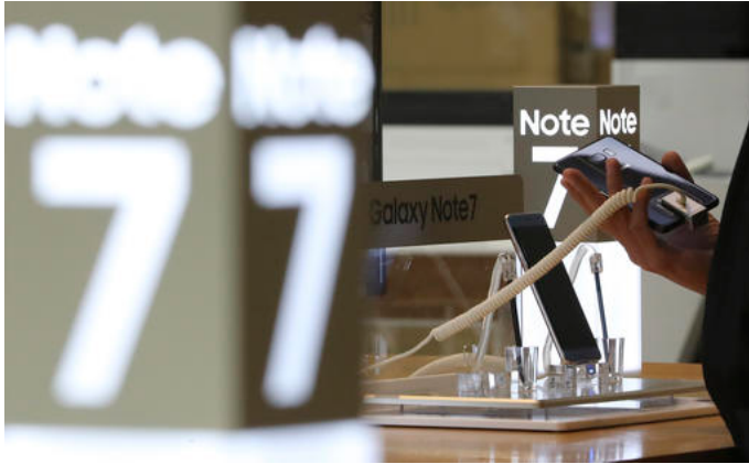
A visitor tries the Samsung Electronics Galaxy Note 7 smartphone at its shop in Seoul, South Korea, Tuesday, Oct. 11, 2016. Samsung said Tuesday it is halting sales of the star-crossed Galaxy Note 7 smartphone after a spate of fires involving new devices that were supposed to be safe replacements for recalled models.