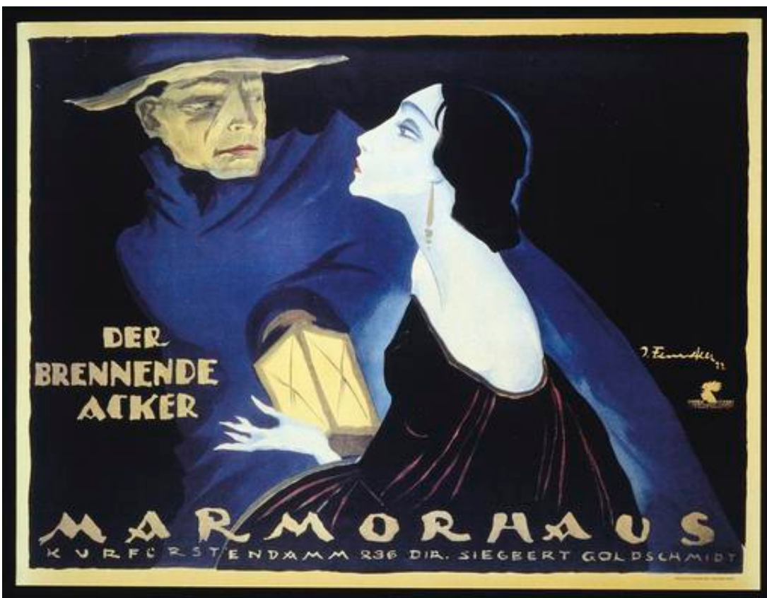
This undated image provided by the Milwaukee Art Museum shows the Ernst Stern and Paul Leni poster for "The Burning Soil (Der brennende acker), 1922.

For those who don't mind being scared silly all night, the Wisconsin Fear Grounds in Waukesha are offering an overnight event called "Night Terrors: 13 Hours of FEAR!" on Oct. 8, complete with tents, fright trail, bonfire ghost stories and scary movies.