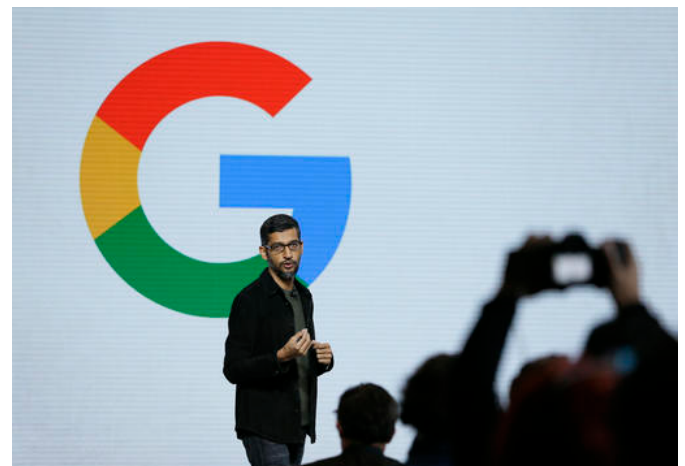
Google CEO Sundar Pichai speaks during a product event, Tuesday, Oct. 4, 2016, in San Francisco. Google launched an aggressive challenge to Apple and Samsung, introducing its own new line of smartphones called Pixel, which are designed to showcase a digital helper the company calls "Google Assistant." The new phones represent a big, new push by Google to sell its own consumer devices, instead of largely just supplying software for other manufacturers.