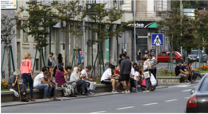
People sit in a street outside their homes, after an earthquake in Skopje, Macedonia, Sunday, Sept. 11, 2016. Macedonian authorities say an earthquake with a preliminary magnitude of 5.3 struck on the outskirts of the capital, Skopje, Sunday causing minor damage to buildings but no injury.