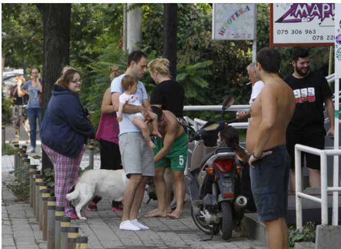
People stand in a street after running out of their homes after an earthquake in Skopje, Macedonia, Sunday, Sept. 11, 2016. Macedonian authorities say an earthquake with a preliminary magnitude of 5.3 struck on the outskirts of the capital, Skopje, Sunday causing minor damage to buildings but no injury.